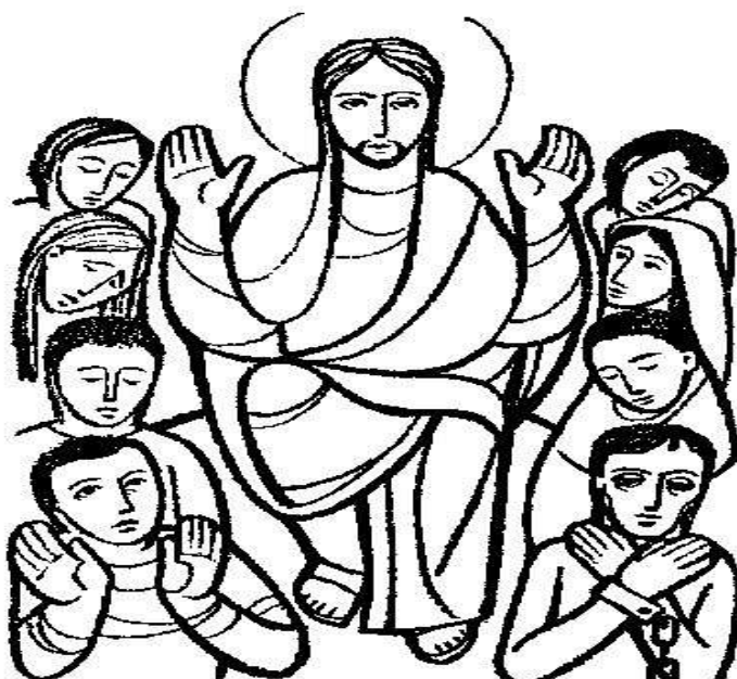
The Way of the Lord

"How happy are the poor in spirit, theirs is the kingdom of heaven." The greatest secret of happiness is to know that nothing we have is our own, it is all gift from God, and that we are totally dependant on God. Life is full of so many gifts and the greatest gift of all is love. But love is a God power. The love you share in your marriage is a very special part of God's gift, not only to you, but also to the world. Treasure it. Treasure one another for our sake. This week let yourself experience the wonder of this love you share and to which you are pledged. This gift of love is also what bonds family members to each other. It needs to be developed or it will become mediocre. And our call is to share this gift of love with all those who form our faith community with us. We do this by our friendliness, our attention to those in need, our willingness to give time to building up our community of faith.